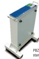
PBZ unit using a vertical stand