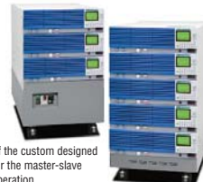
Sample of the custom designed system for the master-slave parallel operation.

The output current can be expanded in master-slave parallel operation connected with the same model up to 2 units using a standard option kit, also above 3 to 5 units can be configured upon request as custom designed.