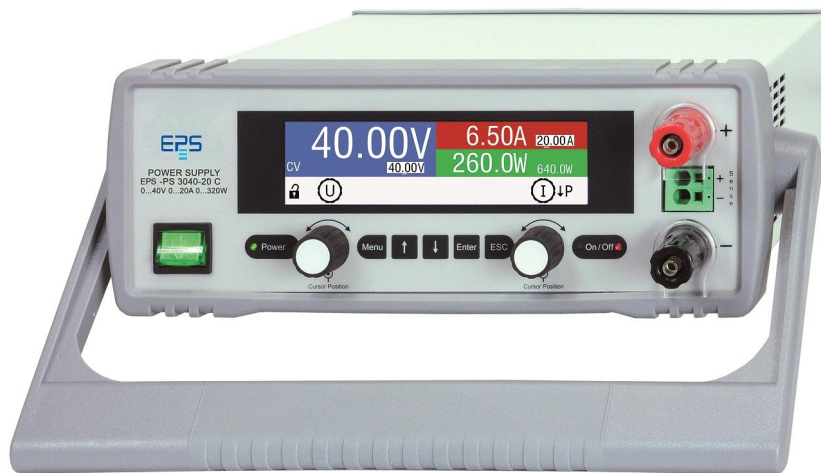
E/PS 3000 C_Front