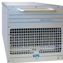
EPS/HC 4000-M3 mit Haltegriffen/brackets