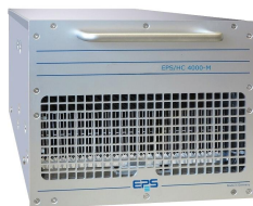
EPS/HC 4000-M3 mit Haltegriffen/brackets