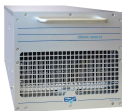
EPS/HC 4000-M3 mit Haltegriffen/brackets