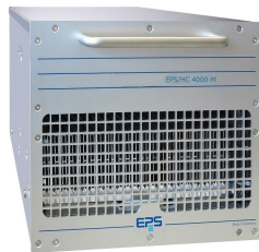
EPS/HC 4000-M3 mit Haltegriffen/brackets