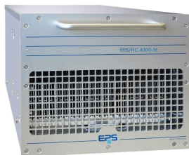
EPS/HC 4000-M3 mit Haltegriffen/brackets