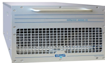
EPS/HC 4000-M3 mit Haltegriffen/brackets