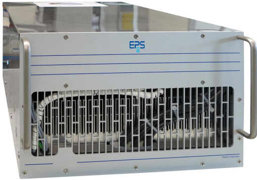
EPS/HC 4000-M4 front