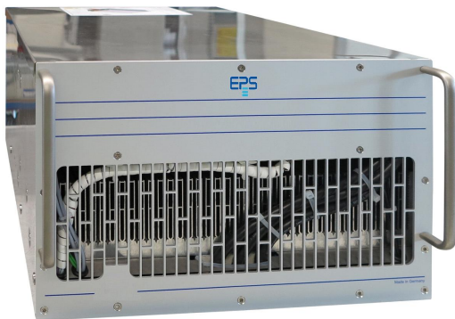
EPS/HC 4000-M4 front