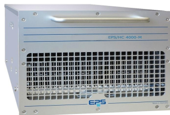
EPS/HC 4000-M3 mit Haltegriffen/brackets