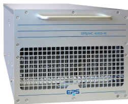
EPS/HC 4000-M3 mit Haltegriffen/brackets