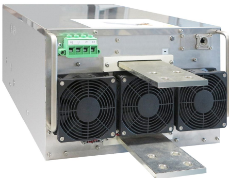
EPS/HC 4000-M4 rear