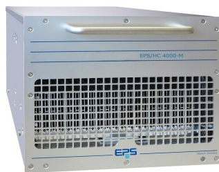
EPS/HC 4000-M3 mit Haltegriffen/brackets