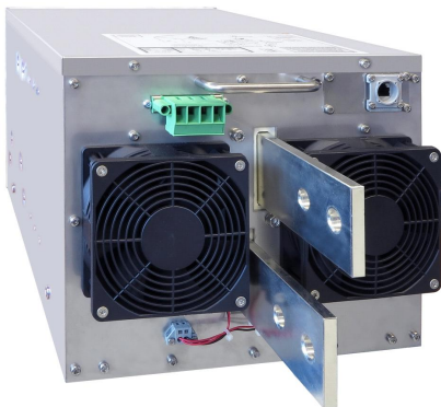
EPS/HC 4000-M3 rear