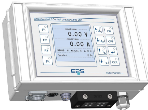
EPS/HC280 Control Panel

Subject to modification without notice, errors and omissions excepted