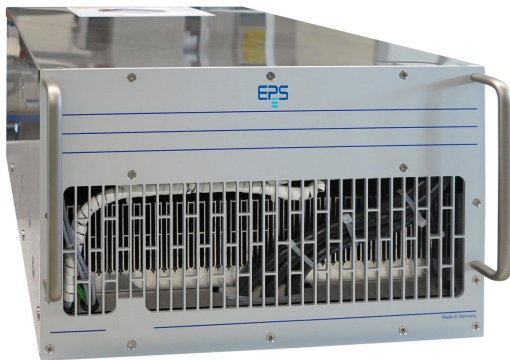
EPS/HC 4000-M4 front