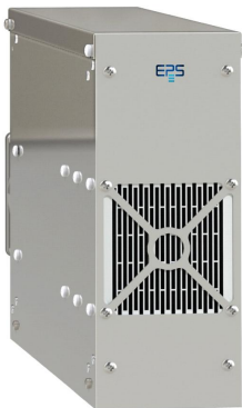
EPS/HC 4000-M1 Front