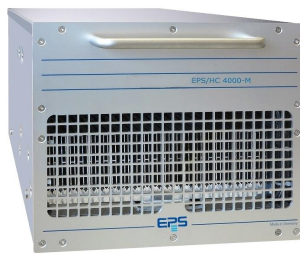
EPS/HC 4000-M3 mit Haltegriffen/brackets