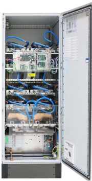
EPS/HC 5000-WC front