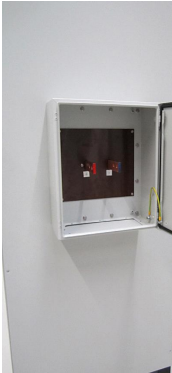
EPS/HC 5000-WC(low current)_rear