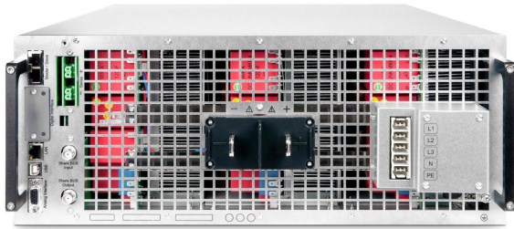
EPS/PUx 10000_4U rear