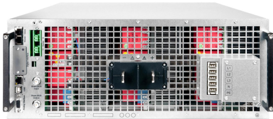
EPS/PUx 10000_4U rear