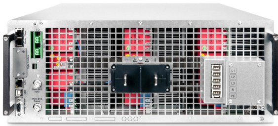
EPS/PU 10000 4U