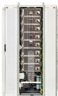
EPS/PUx 10000 Rack rear

Subject to modification without notice, errors and omissions excepted