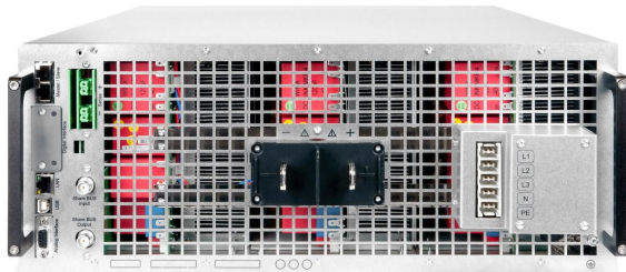
EPS/PUx 10000_4U rear