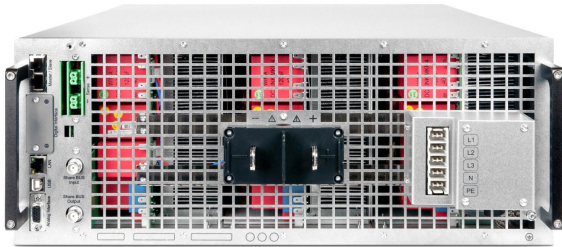
EPS/PUx 10000_4U rear