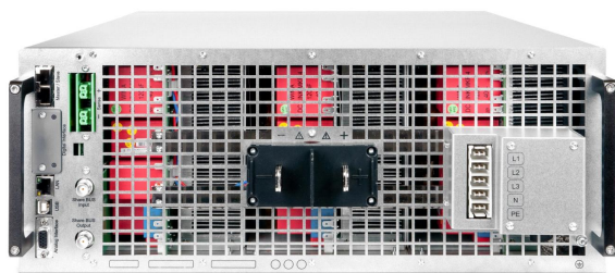
EPS/PU 10000 4U