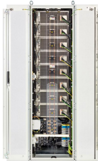
EPS/PUx 10000 Rack rear

Subject to modification without notice, errors and omissions excepted