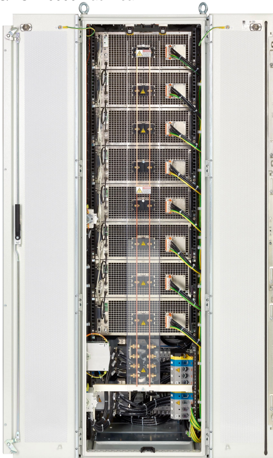
EPS/PUx 10000 Rack rear

Subject to modification without notice, errors and omissions excepted