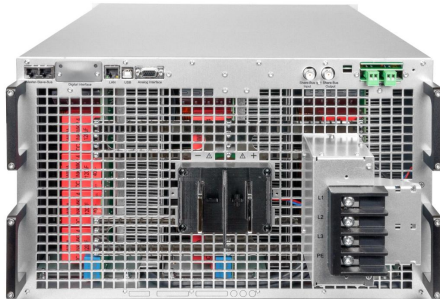
EPS/PUx 10000_6U rear