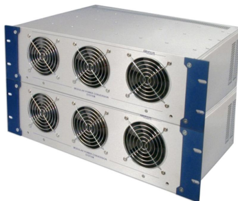
EPS/FTP/T 6000-19rack mount