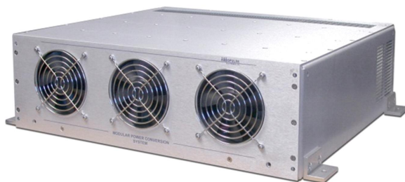
EPS/FTP/T 1500/3000 Chassis