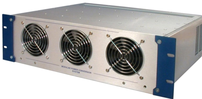
EPS/FC 3000-4500 19rack