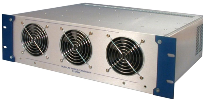
EPS/FC 3000-4500 19rack