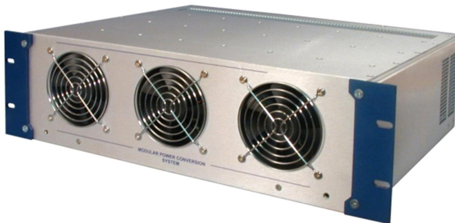
EPS/FC 3000-4500 19rack