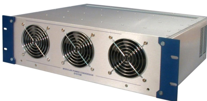
EPS/FC 3000-4500 19rack