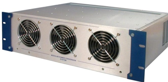
EPS/FC 3000-4500 19rack