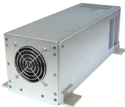
EPS/FC 500 Chassis