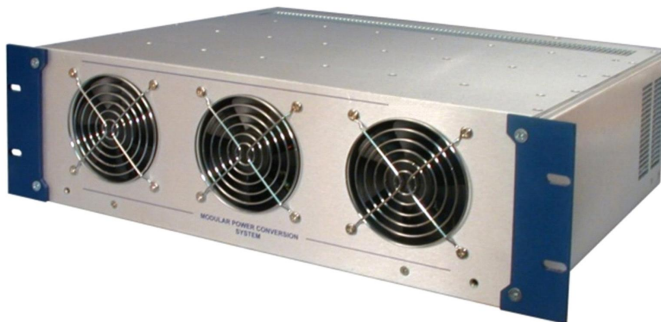
EPS/FC 3000-4500 19rack