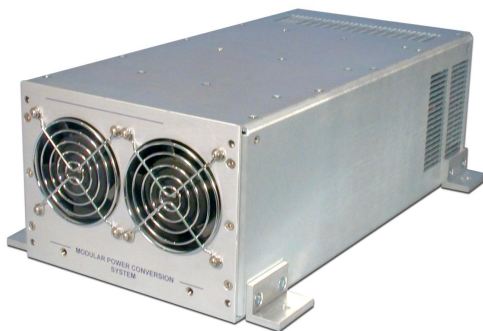
EPS/FC 1000_1500 Chassis