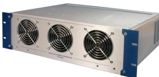
EPS/FC 3000-4500 19rack