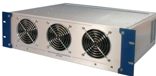
EPS/FC 3000-4500 19rack