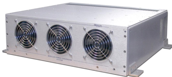
EPS/FC 3000-4500 Chassis