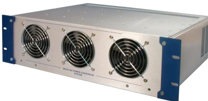
EPS/FC 3000-4500 19rack