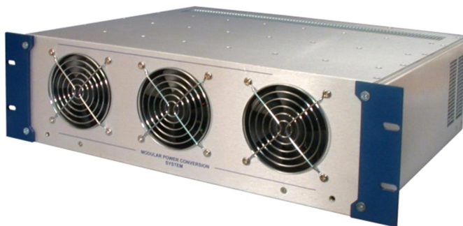
EPS/FC 1000-3000 19"