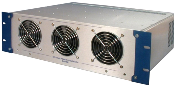
EPS/FC 3000-4500 19rack