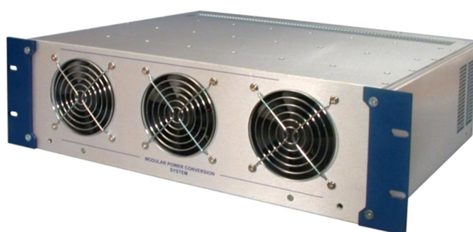
EPS/FC 3000-4500 19rack