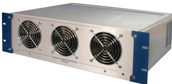
EPS/FC 4000 19rack