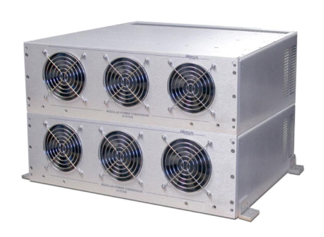
EPS/CPT 6KVA Chassis