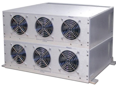
EPS/CPT 6KVA Chassis